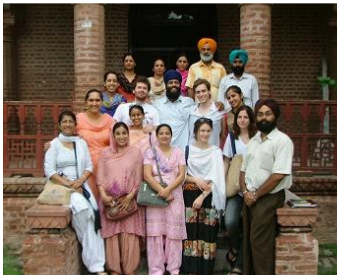
Participants from our 2008 program along with Khalsa College staff

All volunteers teach English at Khalsa College (a 116 year old college situated in the city of Amritsar) and Dhulka School (a village primary school), where they work with students pursuing higher education and children studying in grades 1-12 respectively. At Dhulka School, special attention is given to STARAE students who are tutored by volunteers after school to ensure the cultivation of their talents.