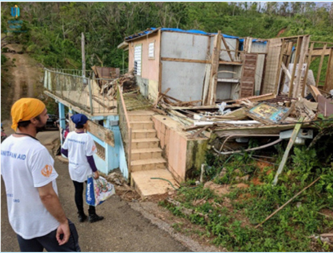
Volunteers providing basic amenities and food packets.