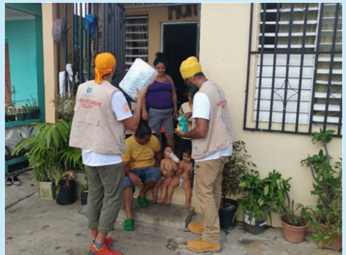
Volunteers visiting homes and providing basic essential supplies.