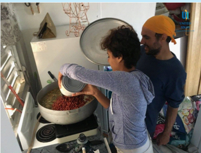
UNITED SIKHS volunteers preparing meals in the kitchen.