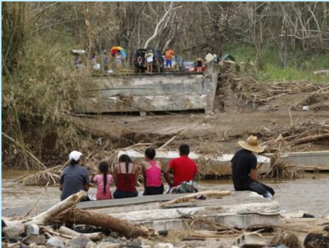
Residents waiting to cross broken bridge.