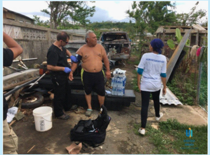
UNITED SIKHS volunteers reaching out in the remote area to provide clean drinking water.