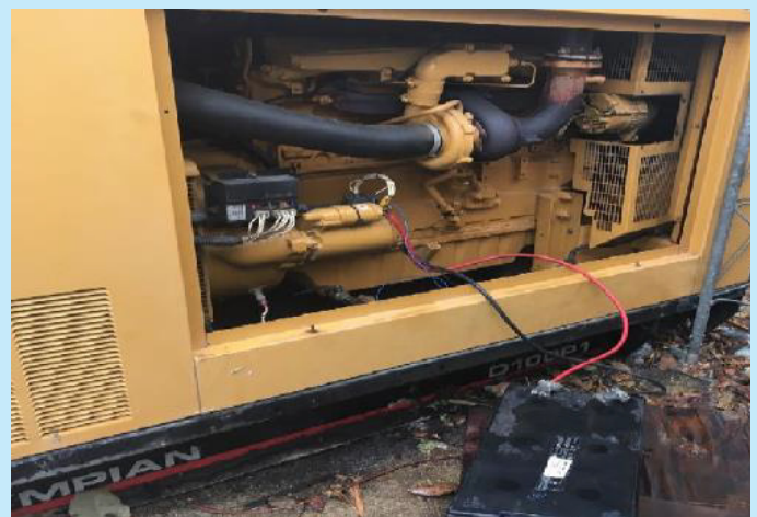
UNITED SIKHS volunteer Engineering team lead by Kamaljeet Singh assessing the damage to the water pump & repairing the generator.