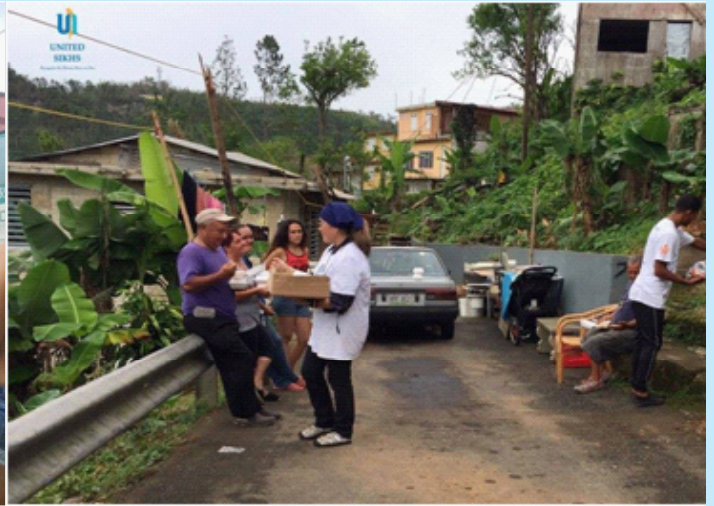
Volunteers providing meals to all in need.