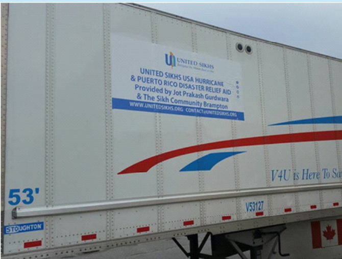
Tons of food supplies & medical aid in the Trailer.