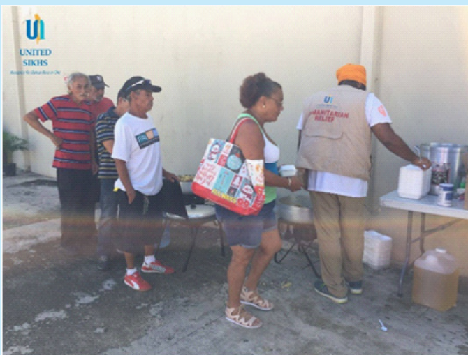
Volunteer serving food to the people in need.