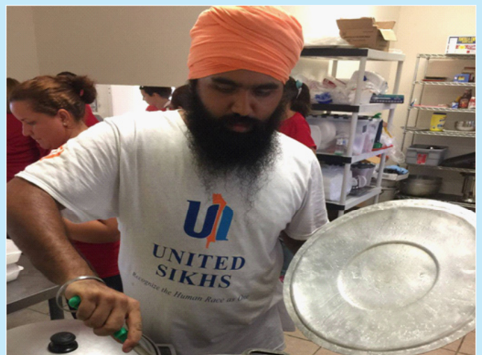
Sevadaars preparing langar in the kitchen to ensure no one goes to sleep hungry in remote areas of Puerto Rico.