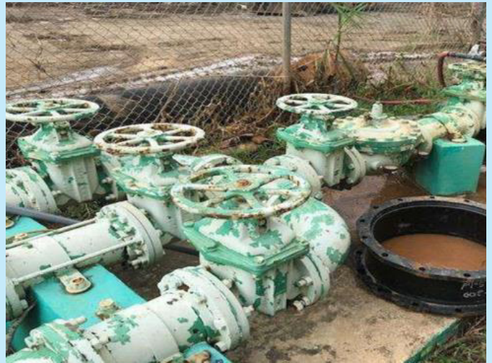
The broken water pump.